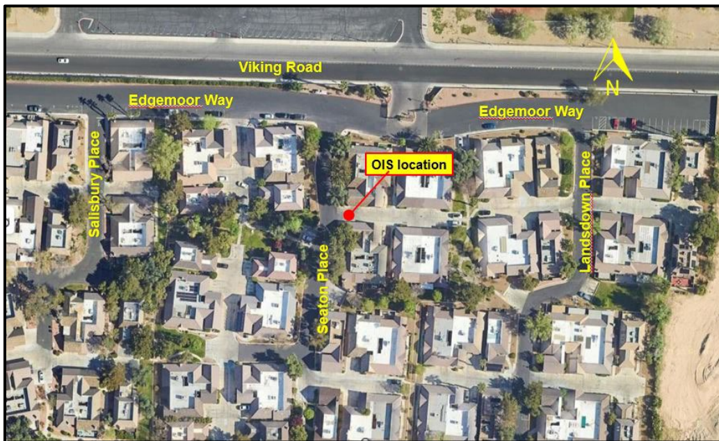
Satellite map of OIS location.

The use of force event occurred in an alleyway to the east of Seaton Place. Seaton Place is in a residential neighborhood to the south of Viking Road and Chaparral High School.