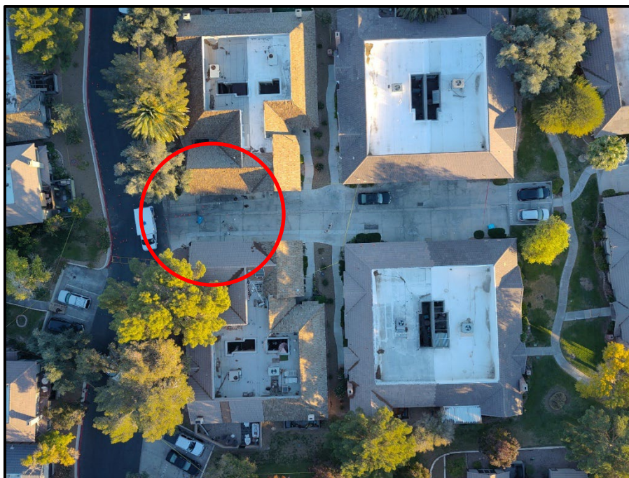
LVMPD drone photograph of OIS location.