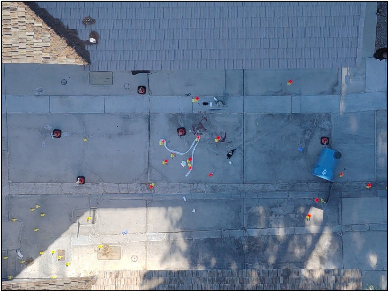
LVMPD drone photograph of OIS location. For orientation, the top of the photograph is south. At the time of the OIS event, subject officers were located near the east edge of the photograph as Decedent charged the officers from behind the overturned garbage can to the west.