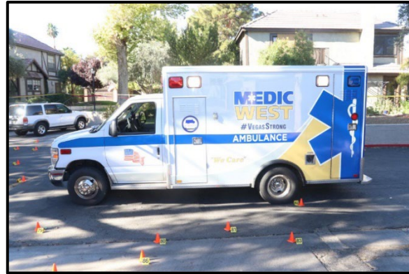
Above left: South facing view of Seaton Place showing low-lethal shotgun shells and bean bag rounds. Above right: Medic West ambulance parked facing south on Seaton Place south of Edgemoor Way.